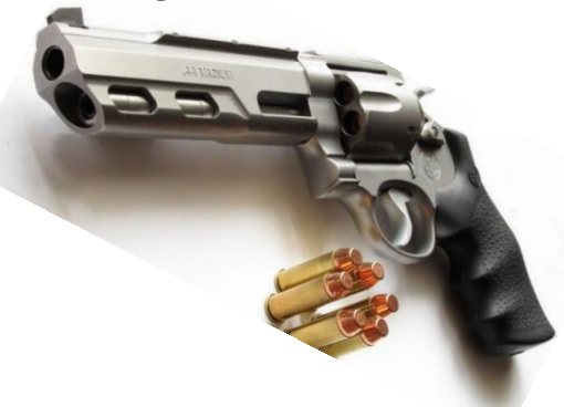
Small gun with bullets