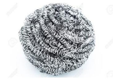
Ball of steel wool